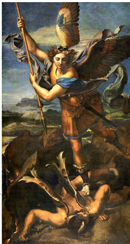
■ St Michael vanquishing Satan by Raphael, 1518

that Michael rescued Constantinople from Persian captivity and, together with Gabriel, rescued a child from drowning in the sea.