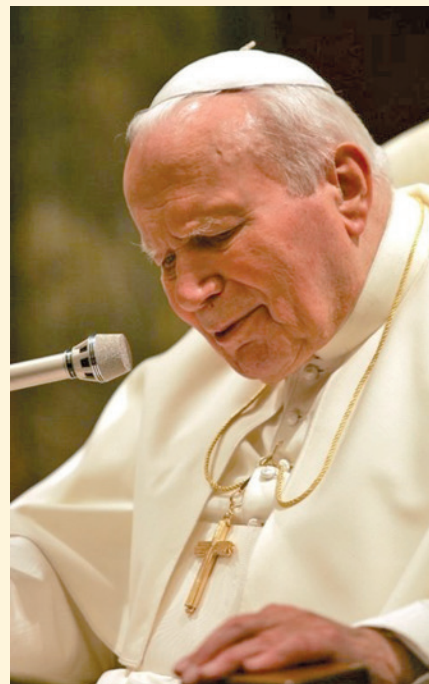
■ St Pope John Paul II

St Pope John Paul II, who was devoted to Our Blessed Mother Mary, said the Rosary was his favourite prayer. He wrote of the importance and meaning of this prayer in his apostolic letter Rosarium Virginis Mariae , issued on October 16 th , 2002, the “Year of the Rosary” and at the beginning of the twenty-fifth year of his pontificate.