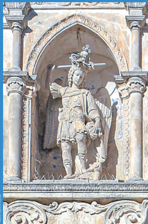
■ St Michael on a wall, Monte Sant'Angelo, Italy

9. By the intercession of St Michael and the celestial Choir of Angels, may the Lord grant us to be