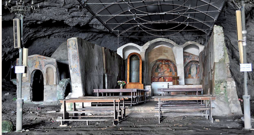
■ Grotto of St Michael in Olevano, Italy

Whenever some act of wondrous power must be performed, Michael is sent, so that his action and his name may make it clear that no one can do what God does by his superior power.