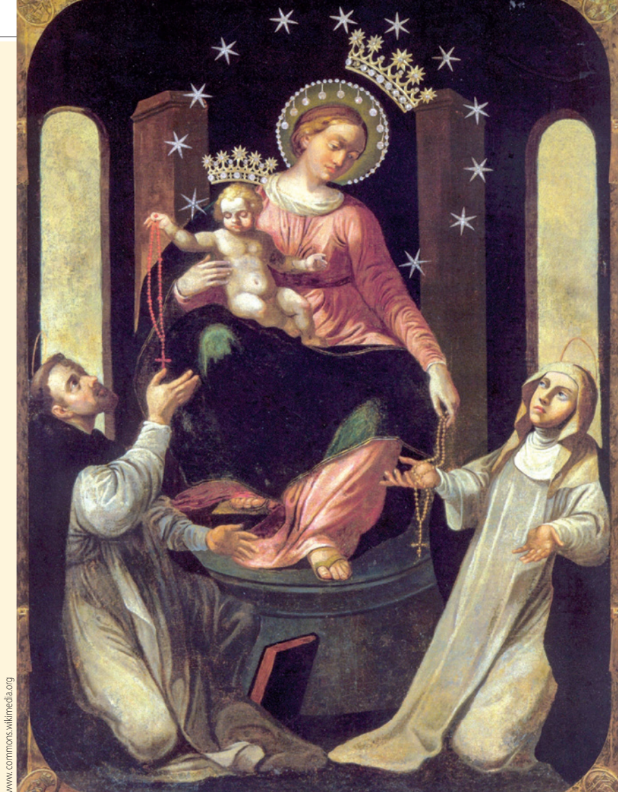
■ Our Lady of the Rosary of Pompeii

means of learning from her to “read” Christ, to discover his secrets and to understand his message.