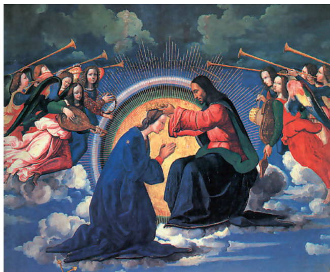
■ The Coronation of the Virgin with Six Saints by Ridolfo Ghirlandaio, 1504

Holy Mary, pray for us. Holy Mother of God, pray for us. Most honoured of Virgins, pray for us. Chosen daughter of the Father, pray for us. Mother of Christ the King, pray for us. Glory of the Holy Spirit, pray for us. Virgin daughter of Zion, pray for us. Virgin poor and humble, pray for us. Virgin gentle and obedient, pray for us. Handmaid of the Lord, pray for us. Mother of the Lord, pray for us. Helper of the Redeemer, pray for us. Full of grace, pray for us. Fountain of beauty, pray for us. Model of virtue, pray for us. First fruit of the Redemption, pray for us. Perfect disciple of Christ, pray for us. Untarnished image of the Church, pray for us. Woman transformed, pray for us. Woman clothed with the sun, pray for us. Woman crowned with stars, pray for us. Gentle Lady, pray for us. Gracious Lady, pray for us. Our Lady, pray for us. Joy of Israel, pray for us. Splendour of the Church, pray for us. Pride of the human race, pray for us. Advocate of grace, pray for us. Minister of holiness, pray for us. Champion of God's people, pray for us. Queen of love, pray for us.