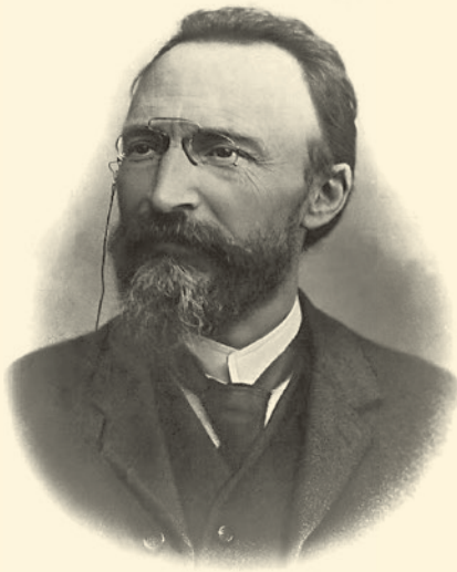
■ Bl Bartolo Longo, the Apostle of the Rosary

11. Mary lived with her eyes fixed on Christ, treasuring his every word: “She kept all these things, pondering them in her heart” (Lk 2:19; cf. 2:51). The memories of Jesus, impressed upon her heart, were always