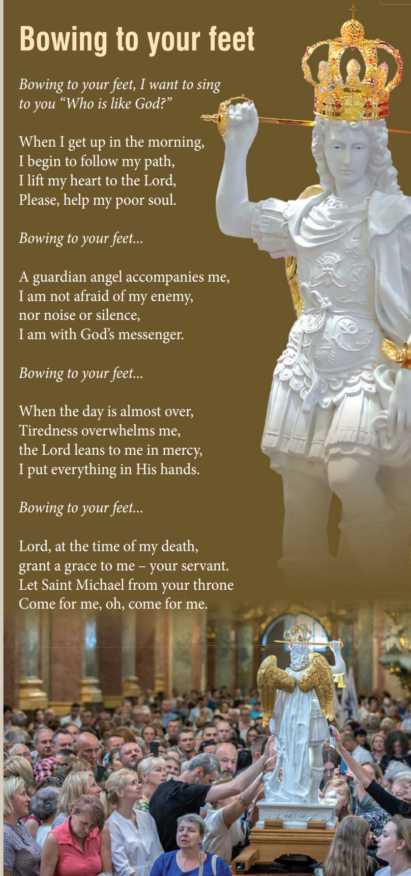
■ Visitation of the statue of St Michael the Archangel in the Black Madonna Shrine, Jasna Góra, Poland, 2019.

Lord, at the time of my death, grant a grace to me – your servant. Let Saint Michael from your throne Come for me, oh, come for me.