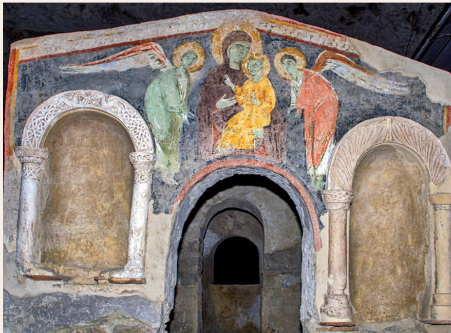
■ Our Lady with Baby Jesus surrounded by Archangels Michael and Gabriel. The grotto in Olevano, Italy

going through Ariano, reaches Salitto. There, having gone around Valle, Castagneto, Busolino, Porta, Salitto and Capocasale, it stops at the sweeping plateau known as Cannabosto. Here, in accordance with tradition, local people brought large stores of food and organised a feast day meal. Every year a firework display takes place between the hills of Castello di Olevano and Ripa di Pappolondo. The procession then again moves off to accompany the figure of St Michael the Archangel back to the grotto. The entire route is extremely tiring and demands extraordinary effort on the part of those carrying the statue, particularly in the section between Cannabosto and the grotto, where the road winds sharply upwards and is very rocky.